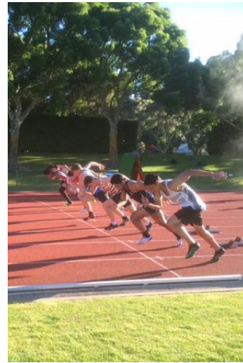
100m school boys off the blocks

SATURDAY 25 th November WAIBOP Centre meeting PORRITT STADIUM