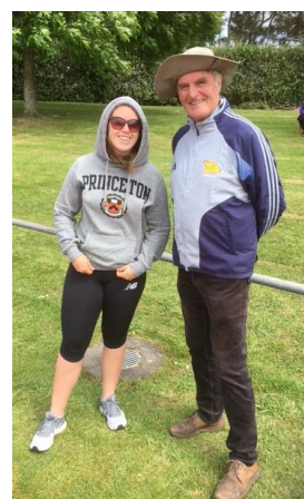
professional observers for HAMMER