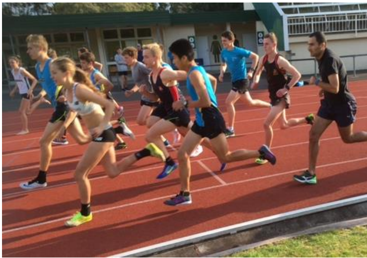
part of the mass start in the 2,000m, last Wednesday