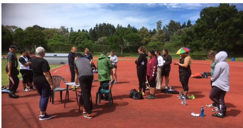
Men's and women's combined hammer prepares for the last 3 throws

As many as 10 personal best performances were recorded in the windy conditions.